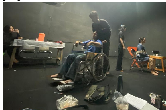
Figure 2: Introduction to props

The next process is the introduction of props. This process needs to be undertaken from the early stages of the acting business search so that actors are familiar with their props. Props are presented based on the script requirements with adjustments for the production. The introduction of props is done gradually to ensure that the exploration of the portrayal does not become stagnant and continues to progress.