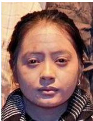
Figure 11. Mrs. Latummahina's makeup

The costume for the character Mrs. Latummahina is arranged based on an analysis of the era, age, and ailments she is suffering from. Here is the costume arrangement for the character: