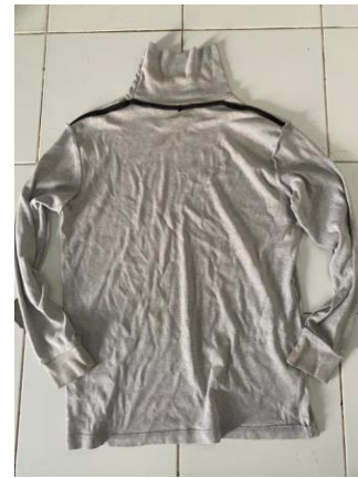
Figure 13. Turtleneck Mrs Latummahina (Documentation: Nazria, 2023)