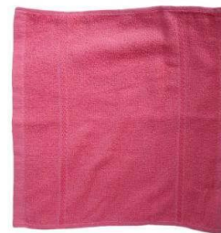
Figure 8: Mrs. Latummahina's handkerchief (Documentation: Nazria, 2023)