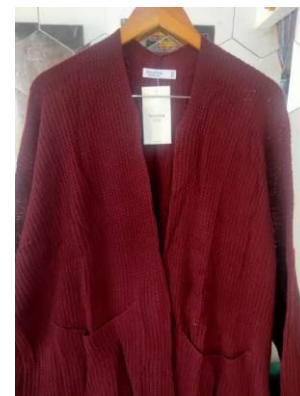
Figure 15. Mrs. Latummahina's knitted cardigan