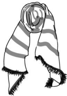
Figure 18. Sketch of Mrs. Latummahina's scarf (Figure oelh : Stephani nurgini, 2023)