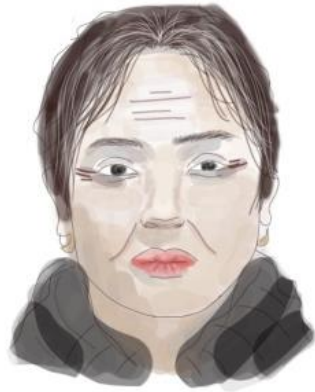
Figure 10. Sketch of Mrs. Latummahina's makeup (Figure: Stephani nurgini, 2023)

makeup design for the character Mrs. Latummahina: