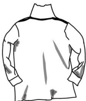
Figure 12. Sketch of Mrs. Latummahina's dress (Figure: Stephani Nurgini, 2023)

The costume for the character Mrs. Latummahina is arranged based on an analysis of the era, age, and ailments she is suffering from. Here is the costume arrangement for the character: