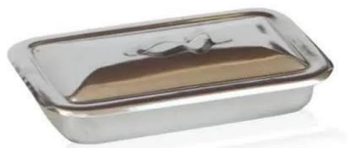
Figure 6: Pisipot Mrs Latummahina