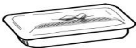
Figure 5: Sketch pisipot Mrs Latummahina (Sketch: Stephani Nurgini, 2023)