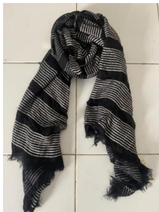
Figure 18. Mrs. Latummahina's scarf