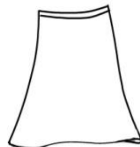
Figure 16. Sketch of Mrs. Latummahina's dress (Sketch: Stephani Nurgini, 2023)