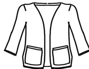
Figure 14. Sketch of Mrs. Latummahina's knitted cardigan (Sketch: Stephani Nurgini, 2023)