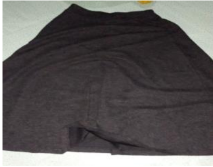
Figure 17. Mrs. Latummahina's dress (Documentation: Nazria, 2023)