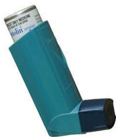
Figure 4: Inhaler Mrs Latummahina