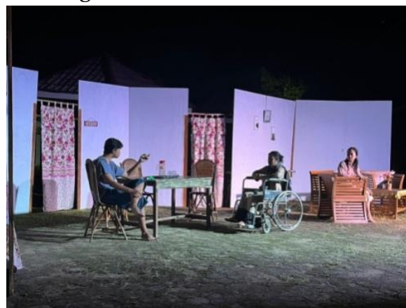
Figure 9: arrangement of blocking

The next step in character development is the arrangement of blocking. Blocking is organized based on the response to the props and stage sets that have been prepared. The arrangement of blocking includes actor composition, movement lines arrangement, movement line development, and naturalization of blocking.