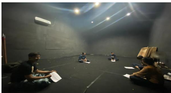
Figure 1: The process of reading a dramatic script

Effort 3 is the process of role creation. The first step in this process is dramatic script reading. This reading is conducted to understand the character development in the story. The goal of this process is to discover the subtext hidden within each dialogue. This subtext is then processed into emotions used to create the motif and acting business.