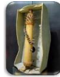
Figure 2. Sasando Violin in a square shape (Personal Documentation, 2019)

In the 1960s, the electric Sasando was later created by the late Arnold Edon. At the beginning of creation, electric Sasando has 30 strings in a form that is still the same as Sasando Gong and Sasando violin that is using Haik as a resonator, but with the addition of an electric current to amplify the sound produced. In the following decades, Sasando electric began to experience the development that is no longer using haik as a resonator and already using metal as a string screw. Electric Sasando is also no longer played in the lap like traditional Sasando , but has used buffer legs to facilitate a Sasando player to be able to move more freely. At the bottom (buttocks- bokong ) there is an electric Sasando output that serves as a connector of Sasando sound to active speakers or electrical devices. The number of strings in the electric Sasando began to experience an increase, some even up to 60 strings. In Edon Sasando alone the number of strings in the electric Sasando that was created was in the range of 30, 32, 36, to 40 strings. Edon explained that this is because increasing the number of strings can also make it difficult for someone to play Sasando since each one of Sasando strings can only be tuned for one note. Therefore, although the number of strings made does not reach 60 strings, but with the modulation technique that can be done on the Edon-style Sasando playing technique, one