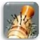
Figure 5. Part Of Sasando Electric Head (Personal Documentation, 2019)