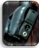
Figure 13. Buttocks Sasando Electric (Personal Documentation, 2019)