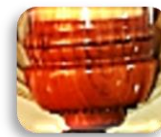
Figure 12. Buttocks Sasando Traditional

Butt Sasando or the lowest part of Sasando has the main function as a place to tie the Sasando string (together with the Sasando head). In electric Sasando , Sasando buttocks have an additional function which is as a place for the output of Sasando jack and sound control produced by Sasando Elektrik.