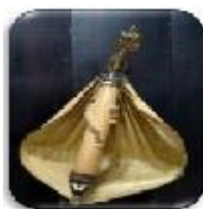
Figure 1. Sasando Violin with haik from woven palm leaves ( lontar )

arrangement than Sasando Gong with pentatonic notes. In terms of shape, the sasando violin resembles sasando gong but with a greater number of strings and a larger diameter bamboo tube ( sasando body) as a consequence of a large number of strings at the sasando violin. The strings on the Sasando violin, in general, are always even. From the initial generation of 24 strings, the strings on the Sasando violin then increased in number to 30, 32, even more, dependent on the creativity of the Sasando maker. Edon said that in its development, there were two types of violin sasando that had been created, namely sasando violin with haik made from woven palm leaves and sasando violin with box-shaped haik (box) made of wood/plywood. However, because of the practicality, aesthetics, and cultural characteristics, Sasando violin with a box-shaped haik began to be abandoned and now people are more familiar with Sasando violin with haik made from palm leaves. Edon also added that the word violin embedded in Sasando violin refers to the shape of the string screw-on Sasando that resembles the violin. This form is used because, in addition to making it easier to rotate, it is also relatively stronger than other forms and can keep the bond of the string in order not to quickly shift from its position. The string turning screw itself was originally made of wood, but in subsequent developments, it was replaced with metal, especially in electric Sasando .