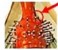
Figure 6. String fastening screws Of Sasando Sasando Tradisional (Personal Documentation, 2019)

be rotated left or right) to adjust the notes on Sasando .