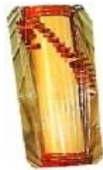
Figure 8. Aon At Traditional Sasando (Personal Documentation, 2019)

to the aon so that the tuning of the notes on the string does not change.