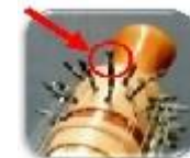
Figure 7. String fastening screws Of Sasando Electrico (Personal Documentation, 2019)