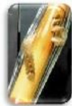
Figure 9. Aon At Sasando Elektrik