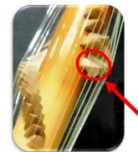
Figure 16. Senda Pada Sasando (Personal Documentation, 2019)

The strings on the Sasando body are called senda , a triangular prism-shaped wood that separates the aon and the strings. The number of senda is as much as the number of strings in Sasando (one senda for one string). Senda is not made static on the aon but can be shifted up and down. The placement also needs to be done carefully because senda functions to regulate the high or low sound produced by Sasando strings. The lower the senda position, the higher the sound produced. Conversely, the higher the senda position the lower the sound produced.