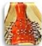
Figure 4. Part Of Traditional Sasando Head (Personal Documentation, 2019)

Sasando head is the part of Sasando which is located at the top, a place to tie haik to traditional Sasando and install string strapping screws.