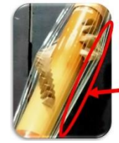
Figure 11. Strings of Metal Strings on Sasando Elektrik (Personal Documentation, 2019)