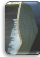
Figure 15. Haik Made of Wood (Personal Documentation, 2019)