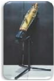
Figure 3. Sasando Electric (Personal Documentation, 2019)

can still play songs that have wide pitch intervals with a smaller number of strings.