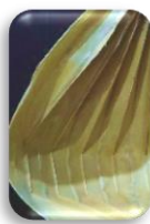
Figure 14. Haik Made from (Palm) Lontar Leaves (Personal Documentation, 2019)