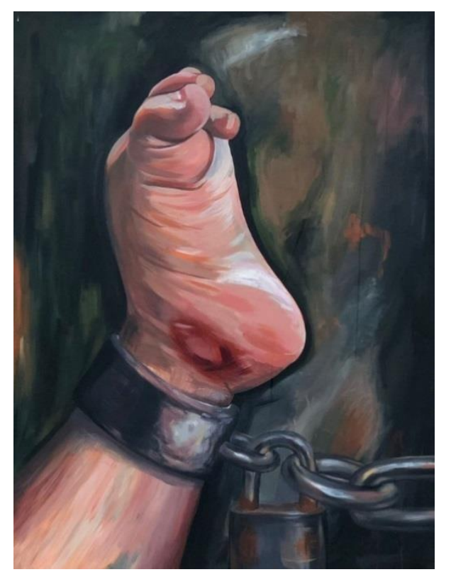
Figure 10. Title of the Artwork: Strict Parents Size: 170 x 130 cm Medium: Mixed Media on Canvas Year: 2023

The first artwork titled "Strict Parents" measures 170 cm x 130 cm and was created using mixed media technique on canvas in 2023. In this piece, there is a representation of a small child's leg bound by a chain and padlock.