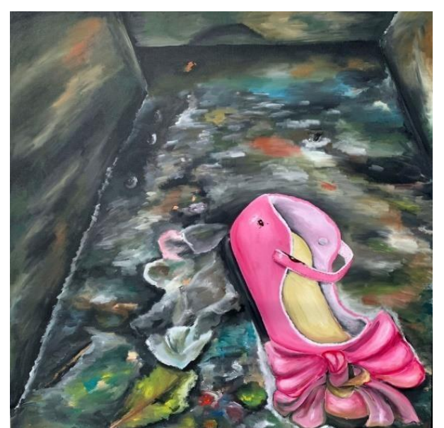
Figure 11. Title of the Artwork: Kemana Rumahku Size: 150 x 150 cm Medium: Mixed Media on Canvas Year: 2023

This artwork is titled "Where Is My Home" with dimensions of 150 cm x 150 cm, using mixed media materials, including sensors, speakers, cables, and wires on canvas, created in 2023. This is the second piece to be reviewed. In this artwork, there is a representation of a girl's shoe placed in a drain with a dark-colored gutter wall.