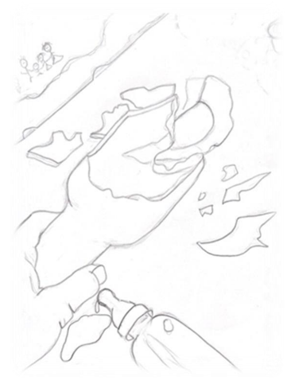
Figure 7. Selected Design 3

Submitted: October 22, 2023 Accepted : December 12, 2023 Published: December 14, 2023