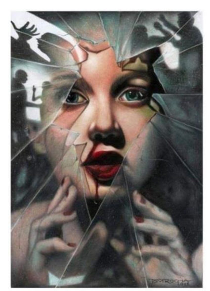
Figure 3. Tom Rocha's work, "No Voice", Acrylic on Canvas, 50 x 78 cm, 2018

The third work under analysis is a piece of art created by Tom Rocha titled "No Voice." In the creation of this artwork, Tom Rocha opted to use colored pencils applied to paper, measuring 50 cm x 70 cm. This piece was crafted in the year 2018.