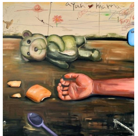
Figure 13. Title of the Artwork: 5 years Size: 150 x 150 cm Medium: Mixed Media on Canvas Year: 2023 (Source: Fini Rahmadesta, 2023)

In the artwork titled "5 Years Old" with dimensions of 150 cm x 150 cm, utilizing mixed media including sensors, speakers, cables, and wires on canvas, this piece was created in 2023. It represents an image of a child's hand lying on the floor. Within the artwork, there are also representations of a toy camera and a teddy bear lying on the floor, with the teddy bear's legs and chest torn.