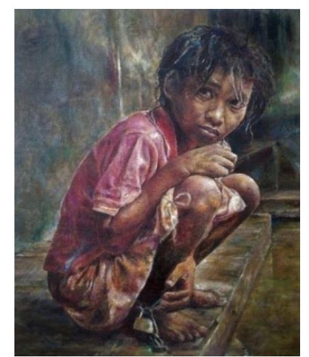
Figure 1. Ari Koneng's work, "My Angel" Acrylic on Canvas, 105 x 128 cm, 2018 (Source: Wijoto, 2021)

Submitted: October 22, 2023 Accepted : December 12, 2023 Published: December 14, 2023