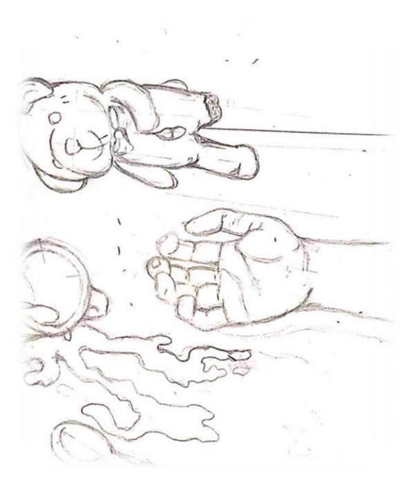
Figure 8. Selected Design 4