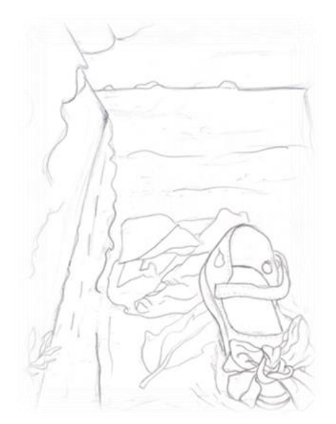
Figure 6. Selected Design 2