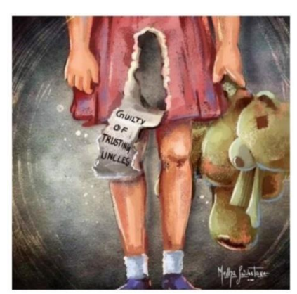
Figure 4. Meda Rivastava's work, "Stop Child Abuse", Digital Painting, 100 x 80 cm, 2018

The artwork "No Voice" by Tom Rocha presents an image of a woman gazing through a shattered window with signs of injuries on her nose and a bleeding mouth. The woman looks forward while holding a part of the broken window. Within the window, there is a shadow of a conflict between a man and a woman, with the visualization of the man committing physical violence against the woman. In the context of creating this artwork, there is a similarity in choosing women as the subject. However, a significant difference lies in Tom Rocha's approach. He portrays a teenage girl, while the writer focuses more on representing a five-year-old girl looking through a hole in the wall. The writer emphasizes the eyes of the little girl and does not depict the entire figure of the woman, as seen in Rocha's work.