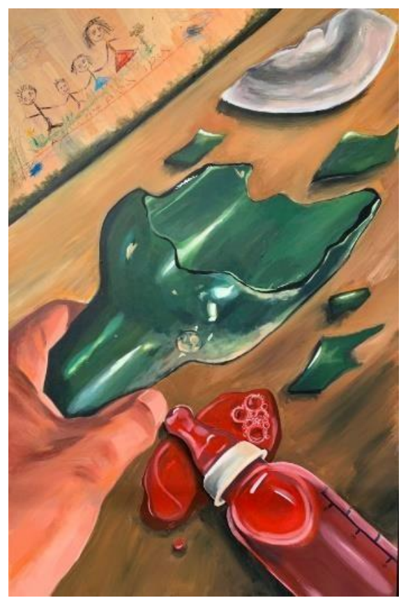
Figure 12. Title of the Artwork: Homesick Size: 180 x 120 cm Medium: Mixed Media on Canvas Year: 2023

The artwork titled "Home-Sick" measures 170 x 130 cm and utilizes mixed media, including sensors, speakers, and cables. Created in 2023, it is the third piece in a series of artworks. In this piece, there is a representation of a hand holding a bottle of alcoholic beverage.