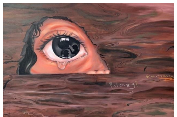
Figure 14. Title of the Artwork: Traumatis Size: 180 x 120 cm Medium: Mixed Media on Canvas Year: 2023

The third artwork titled "Traumatis" measures 180 x 120 cm and utilizes mixed media including sensors, speakers, and cables. It was created in 2023. In this piece, the artist portrays themselves as a young girl who is the subject of the painting.