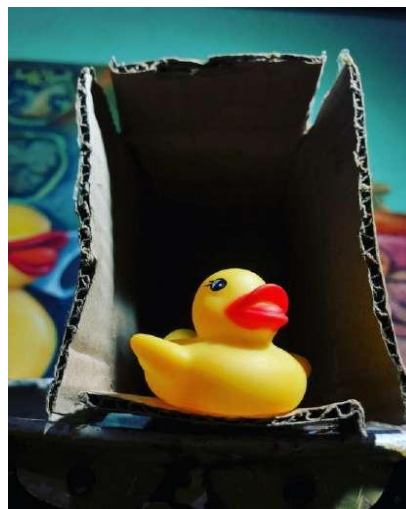
Figure 1. Rubber Duck Toy

is a depiction of happiness that occurred in the past with an object that is felt to depict that happiness. The author was inspired by a childhood toy in the form of a rubber duck that has a striking color, simple shape, and attractive appearance. The author tries to associate the object with the emotion of happiness. Happiness, in this context, can be generated through simple things such as the shape produced by the rubber duck toy which, although simple, is able to bring a feeling of joy. The bright color of the rubber duck attracts attention, making it not only an object of play but also a “friend” when playing. In addition, the flexible nature of rubber is considered a representation of elasticity in social communication that can bridge relationships between individual humans.