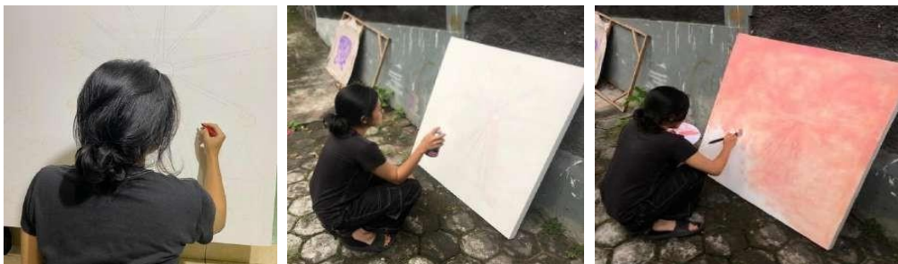
Figure 2. (a) Sketching process on canvas, (b) spray process for underpainting, (c) underpainting process 1.

The Creation Process, will present documentation of the steps regarding the process of making one of the works, starting from sketching to the realization of the artwork. The following are the stages carried out during the process of creating the seventh work, which has the title "Ferris wheel":