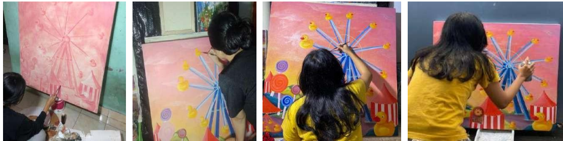
Figure 3. (a) Underpainting Process 2, (b) Painting Process, (c) Detailing Process

Sketching process on canvas. The artist draws a sketch using colored pencils with a choice of colors according to what will be realized with oil paint. Spray process for underpainting, this process is the coating of the sketch on the canvas using spray clear, the aim is to prevent the sketch from changing or disappearing during underpainting. This stage is to adjust the color of the painting in the next process.