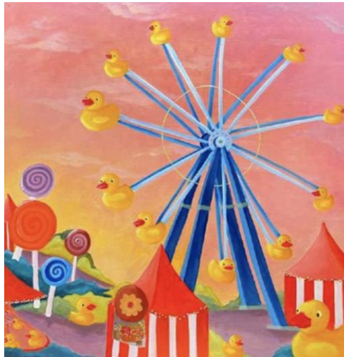
Figure 6. Bianglala , Oil on Canvas, 100 x 100 cm, 2024, Cllauvitra Rheyne

The title “Ferris wheel” is taken because of the rotating system of the Ferris wheel and depicts a wheel and the dynamics of life that are sometimes at the bottom, and sometimes at the top. Although there is a feeling of fear to play the rides, there are joys that arise that can be obtained. From this description, it can be interpreted that we must remain grateful and happy in any situation, just like we ride rides in the playground. In the work, we can see the Ferris wheel, festival tents, candy statues, and the main object of rubber duck toys that create a cheerful atmosphere. The Ferris wheel in the work is depicted with large dimensions, painted in dark blue, and the levers are painted in a lighter blue color. At each end of the Ferris wheel there is a rubber duck toy depicted with dimensions that are not too large.