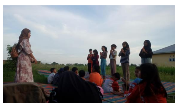
Figure 4. Learn regional dance

House provides opportunities for its participants to develop their creativity through various arts and cultural activities. This not only enhances their artistic abilities but also helps in the development of creative thinking skills, which is an important aspect in modern education.