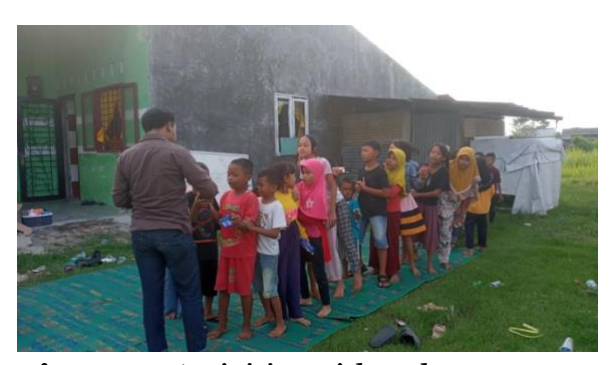
Figure 2. Activities with Volunteers

RKTB also realizes that parents play a very crucial role in forming children's early character. The role of parents is considered crucial because it generates emotional values that can shape children's character so that they become humanistic individuals and have deep relationships in their lives. So in every activity RKTB appeals to and provides affirmation to parents in their children's education.