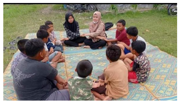
Figure 3. Childrens's Games at RKTB

Of the 10 children who were respondents, they also stated that students at RKTB could express their dreams. This has implications for increasing children's optimism and orientation towards good things. This value arises because children at RKTB are given the opportunity to speak in public and share their thoughts.